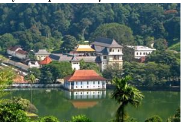
Day 01: Airport – Kandy

Arrival at the Colombo Airport You will be met by our Sanki Leisure staff and English speaking Chauffeur Guide and you will Transfer to Kandy. Dinner & Overnight at Kandy.