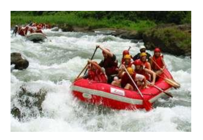
Day 06: Kitulgala – Negombo – Colombo

After breakfast transfer to Kitulgala, a little town on the banks of the Kelani River and the film location of the famous movie "Bridge on the River Kwai". Begin Whitewater rafting excursion. The rafting begins further upstream which winds down through lush forests, hills and sand bars, taking approximately 02 hrs and ends back at the Plantation Hotel. The short but exhilarating rafting programmer is level three. At evening You will be transferred to the Colombo. Dinner & Overnight at Colombo