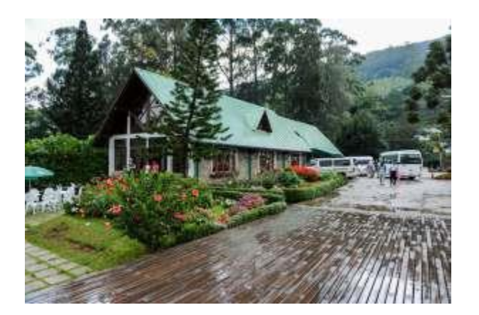
Day 03: Kandy – Nuwara Eliya

After breakfast leave for Nuwara Eliya via Ramboda Falls En route visiting a tea factory/plantation some and beautiful waterfalls. Nuwara Eliya. This town seems like a piece of English district. Tudor-style and Victorian homes look across the blue lake. These buildings are the other architectural monuments to the English, the Post Office, the English country house like Hill Club with its hunting pictures, mounted hunting trophies and fish, Anglican Church and private residence. The Golf course here is one of the best in Asia. At evening Walking sightseeing tour of Nuwara Eliya. Dinner & Overnight at Nuwara Eliya