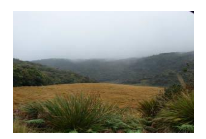
Day 04: Horton Plains – Nuwara Eliya

After breakfast Excursion to Horton Plains Nature & Wild Life Reserve.Short trek to Worlds End & Bakers Falls. The Horton Plains National Park is the only National Park situated in the Hill Country and falls within the Nuwara Eliya district and is 200 km. away from Colombo. Panoramic scenic beauty of the Hill Country could be witnessed within the Park. The famous 'Worlds End' is a major attraction within the Park. Endemic slender loris and endemic purple monkey are among the important animal species that could be seen in addition to sambhur, a member of the cat family etc. There is some endemic avifauna also found within this Park. Dinner & Overnight at Nuwara Eliya