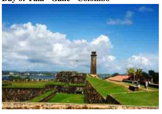
Day 6: Yala - Galle - Colombo

After breakfast, you will visit the <u>Galle Dutch Fort</u> before your return to Colombo, transfer to airport or drop off at a beach extension hotel of your choice