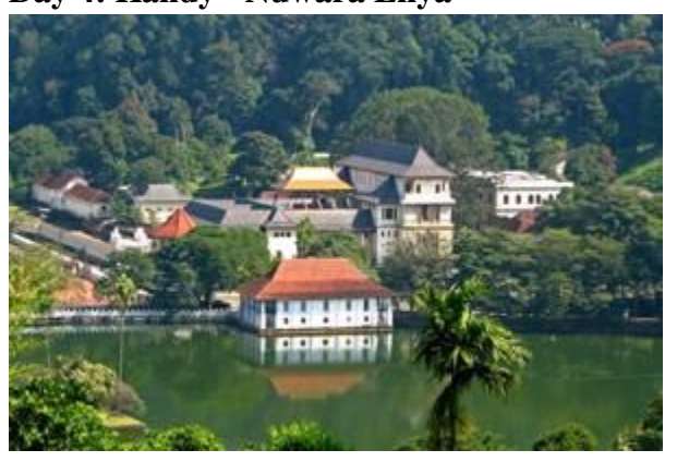
Day 4: Kandy - Nuwara Eliya

After breakfast at the hotel. On the way to Nuwara Eliya, we will take the Upper Lake Drive and visit the Royal Botanical Gardens at Peradeniya, the Elephant Orphanage at Pinnawela and a Tea Plantation, to see women plucking the 'Green Gold' tea leaves. Upon arrival at Nuwara Eliya, we will take a late afternoon tour of Little England before dinner and check in at the hotel. Overnight stay at Nuwara Eliya