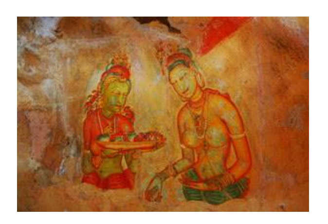
Day 3: Sigiriya - Dambulla - Kandy

Breakfast at the hotel will be followed by a visit to Sigiriya Rock Fortress. Having climbed the rock, you will encounter the remains of the Palace and its surroundings. En route to Kandy, we will visit the Dambulla Rock Cave Temple and a Spice Garden Matale.