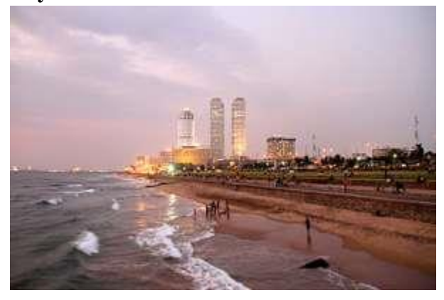
Day 1: Arrival - Colombo

You will be welcomed by Sanki Leisure representative at the airport before you are transferred to Colombo. After checking in at the hotel, you will go on an afternoon city tour of Colombo. You will return to the hotel for dinner and overnight at hotel